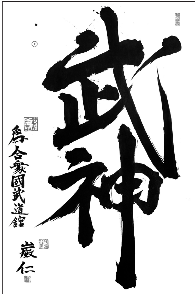
Bu Shin Warrior Spirit